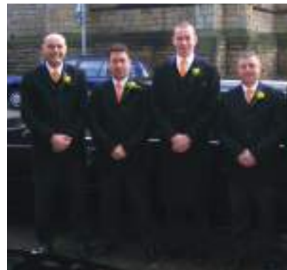
Funeral Directors wear orange ties for a funeral organised by The Co-operative Funeralcare in South Shields, Tyne and Wear.

Sometimes, regrettably, clothing choices have to be turned down in cases of cremation as there are strict rules governing crematoria emissions.