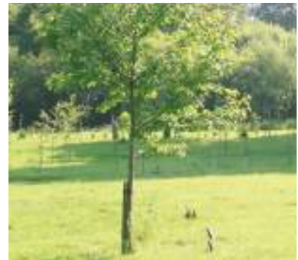
A memorial tree planted within a natural setting.