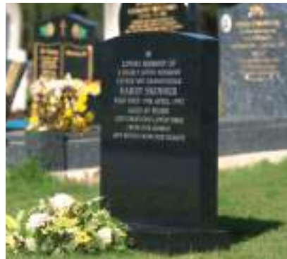
Traditional headstones are still a popular way to commemorate a loved one.