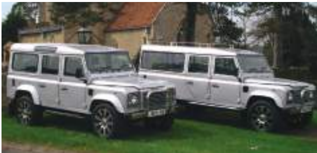
A Land Rover hearse provides a unique way to personalise the funeral of a Land Rover enthusiast.

Nowadays, the Funeral Director would tend to page the funeral just a short distance, then would continue the drive slowly as a mark of respect and to allow the rest of the cortege to remain together. Very occasionally, walking funerals are performed where family and friends take it in turns to bear the coffin.