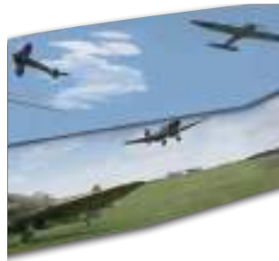
Picture coffin with aeroplane design.