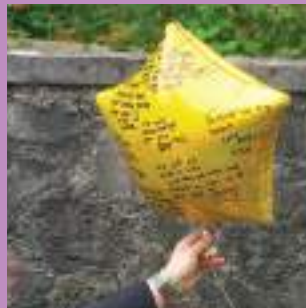
A balloon, signed by friends, released as part of a funeral ceremony.