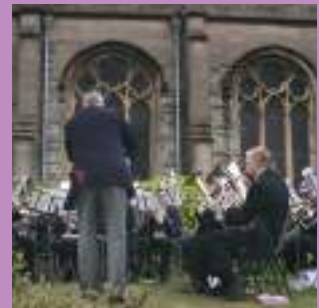
Brass band playing outside in the church grounds.