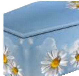
Coloured cardboard coffin.