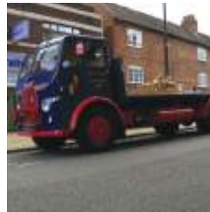
A 1950s Leyland Beaver lorry carrying a loved one for their final journey.