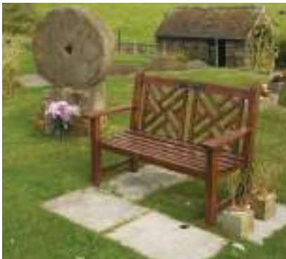
Memorial benches are becoming increasingly available in crematoria and woodland burial grounds.

We have had ashes made into a diamond, which can be worn in a ring or around the neck. Ashes are placed on the mantelpiece or in a birdbath for the garden...the choice is far wider nowadays.”