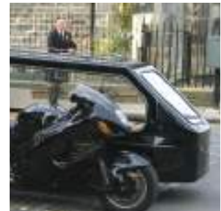
An authentic motorcycle hearse can provide a fitting farewell for a loved one.