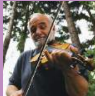
Musical instruments played at the graveside can be touching and uplifting.