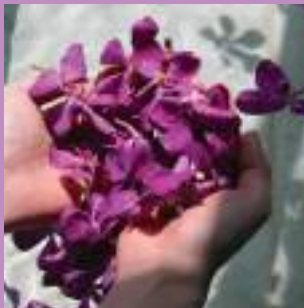
Flowers or petals can be scattered at the graveside.

Just recently we had a father and son playing musical instruments at the graveside. They played a jazz tune as the deceased was being lowered.”