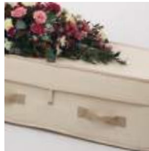
Coffin made from British wool.