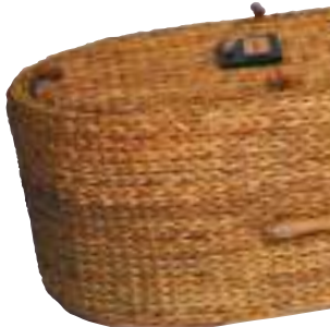
Water hyacinth or banana leaf coffins

'Personalised' coffins in different shapes, colours and materials are starting to appear more frequently. Picture coffins, or materials such as wool and cardboard are becoming more popular.